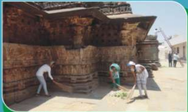
Premises by students under Heritage Club.