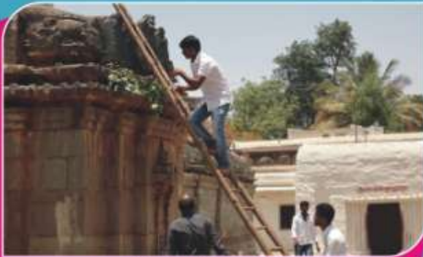
Cleaning of Renowned Trikuteshwar Temple