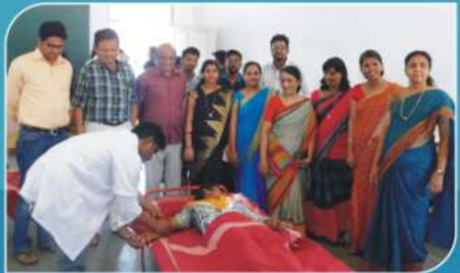
Blood Donation Camp by YRC, RRC & NSS Volunteers in Association with IMA